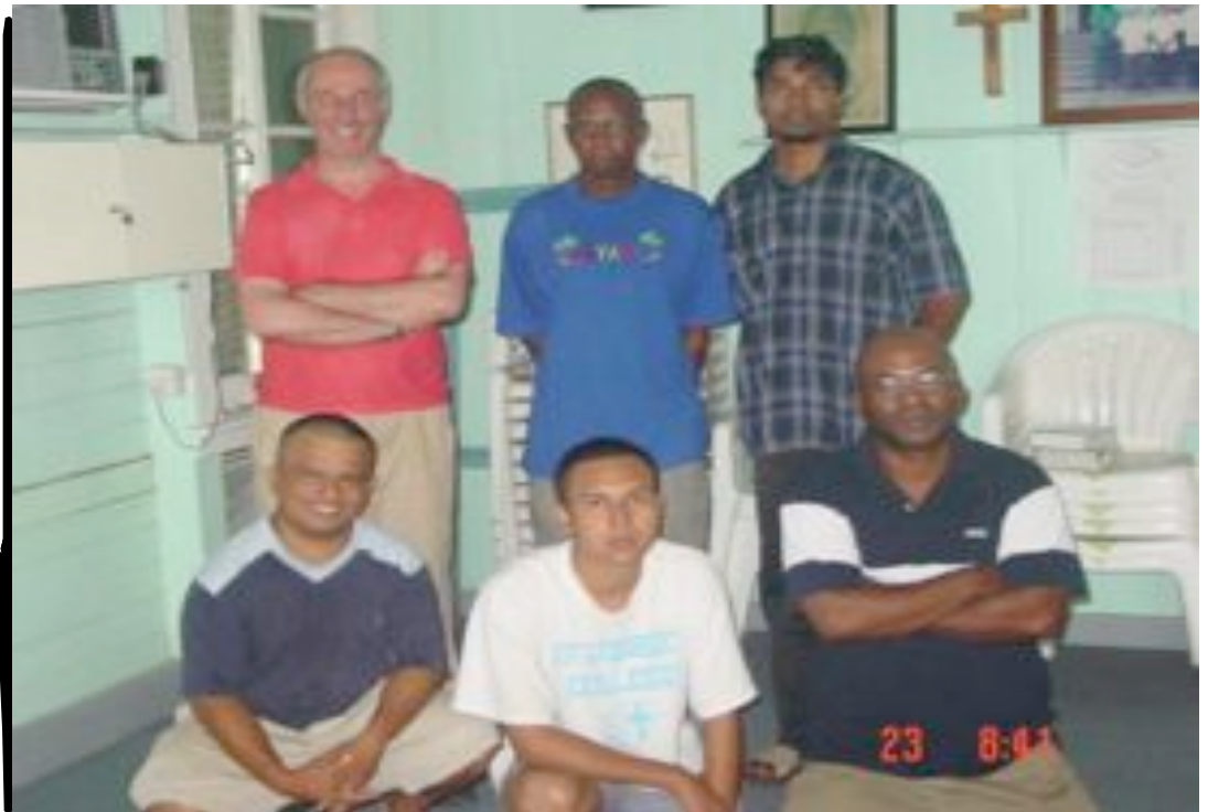
Regional Superior 'hangs out' with the younger ones.....